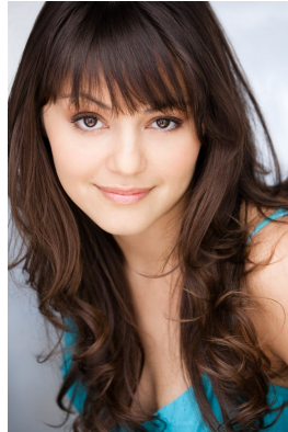
Cont. Page 3

I've learned that it's all about knowing your strengths as an actor, what